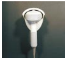
Clockwise from left: Gryphon Stand, Desk holder, Wall holder